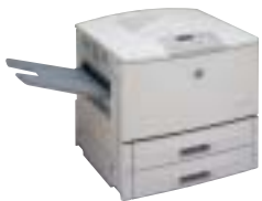
hp LaserJet 9000n printer