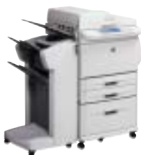
hp LaserJet 9000mfp/9000Lmfp printer with optional stapler/stacker

The HP LaserJet 9000 series is one of a new generation of internet-enabled devices, offering general office users in demanding workgroup environments outstanding high volume performance from a proven reliable platform.