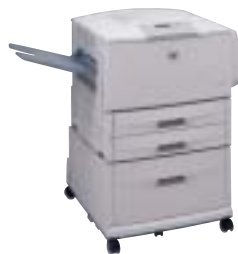
hp LaserJet 9000dn printer with optional 2000-sheet feeder