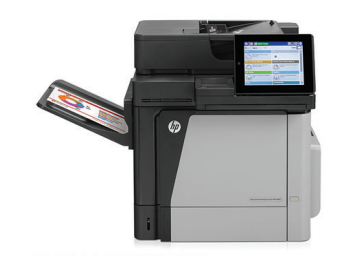
HP Color LaserJet Enterprise Multifunction M680dn

Tackle high-volume jobs with this high-performance colour MFP. Print and copy, plus scan and fax. Enhanced scanning features and a 20cm (8-inch) colour touchscreen smooth workflows. Mobile printing options help you stay productive on the go<sup>2</sup>.