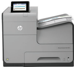
HP Officejet Enterprise color X555dn Printer

A printing revolution for your enterprise. Produce colour documents at up to twice the speed and half the cost per page of colour lasers 1,2 . Designed with advanced security and full manageability, this enterprise printer is built to last.