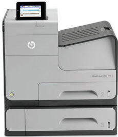
HP Officejet Enterprise color X555xh Printer