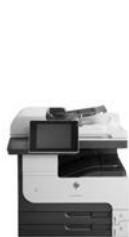
HP LaserJet Enterprise MFP M725dn