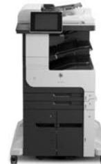
HP LaserJet Enterprise MFP M725z+