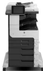
HP LaserJet Enterprise MFP M725z