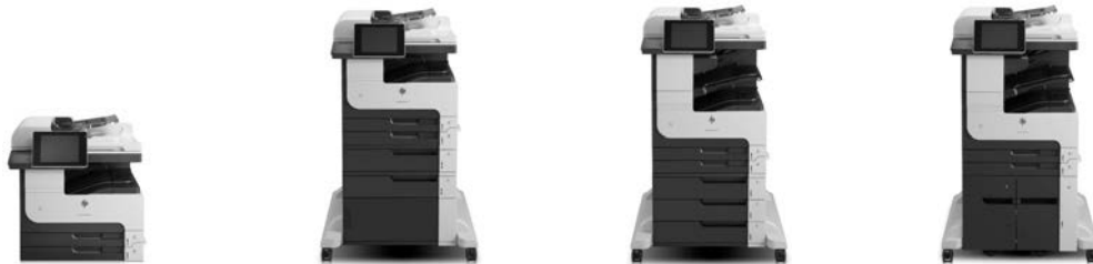
HP LaserJet Enterprise MFP M725dn