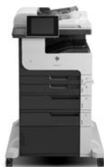
HP LaserJet Enterprise MFP M725f