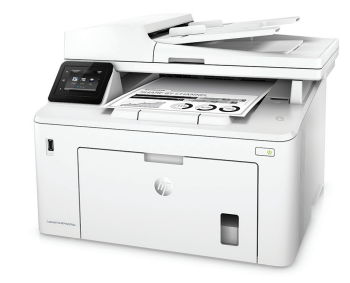
HP LaserJet Pro MFP M227fdw