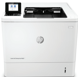
HP LaserJet Enterprise M607dn