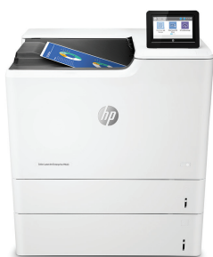
HP Color LaserJet Enterprise M653x