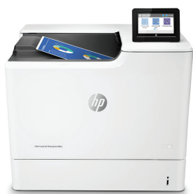
HP Color LaserJet Enterprise M653dn

This HP Colour LaserJet Printer with JetIntelligence combines exceptional performance and energy efficiency with professional-quality documents right when you need them – all while protecting your network with the industry's deepest security. 1