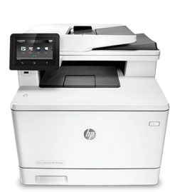
HP Color LaserJet Pro MFP M477fdw

Dual-band Wi-Fi for more reliable wireless connection 7 and Bluetooth ® Low Energy for easy wireless printing and setup; 8 HP Roam for Business 10