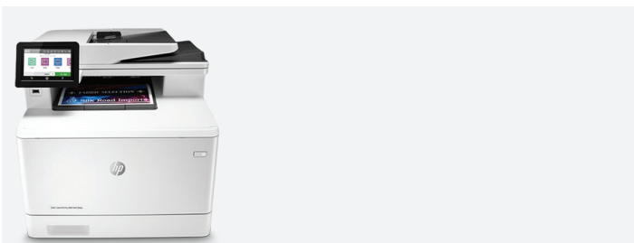
HP Color LaserJet Pro MFP M479fdw

10.9 cm customisable touchscreen with intuitive icon-based user interface 3