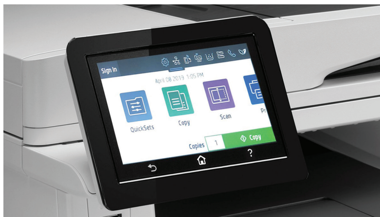
Customise frequently used tasks with Quick Sets feature 3

Speed through print jobs right out of the box. This printer is shipped with preinstalled, specially designed Original HP LaserJet toner cartridges with JetIntelligence. Auto seal removal enables simple and seamless cartridge replacement, so you can get back to business fast—without costly delays or frustrating messes.