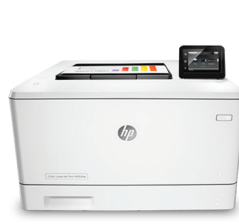
HP Color LaserJet Pro M452dw

Dual-band Wi-Fi for more reliable wireless connection 7 and Bluetooth ® Low Energy for easy wireless printing and setup; 8 HP Roam for Business 10