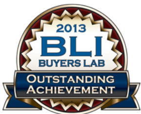
Rely on "the industry's first policy-based imaging and printing compliance solution." 14

For environments where few devices are deployed, IT may choose to manage each device individually via the HP Embedded Web Server management interface, which employs HTTPS for encryption and has access controls. In addition, HP provides security wizards to assist in proper security setup.