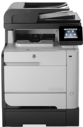
HP Color LaserJet Pro MFP M476dw with optional 250-sheet tray 3 shown