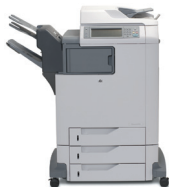
HP Color LaserJet 4730xm mfp