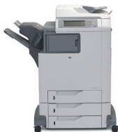
HP Color LaserJet 4730xs mfp

End users and IT managers alike will find this expandable MFP very easy to use and manage.