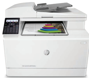
HP Color LaserJet Pro MFP M183fw