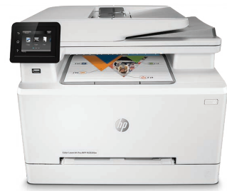
HP Color LaserJet Pro MFP M283fdw

HP Color LaserJet Pro MFP M283fdn HP Color LaserJet Pro MFP M282nw