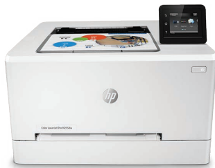
HP Color LaserJet Pro M255dw

If you don't have access to the Internet, contact your qualified HP dealer.