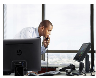
Simple one-to-one device management The printer can also be managed using the HP Embedded Web Server. Use a web browser to monitor status, configure network parameters, or access device features.