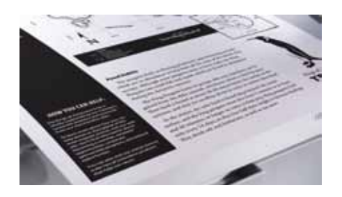
Sharper prints, more readable text

HP Monochrome Toner technology produces sharper images and crisp text.