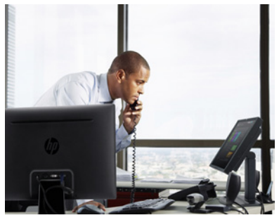
Simple one-to-one device management

The MFP can also be managed using the HP Embedded Web Server (EWS). Use a web browser to monitor status, configure network parameters, or access device features.