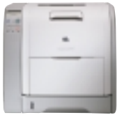
HP Color LaserJet 3500/n Printer series

An excellent choice for small and medium sized businesses, the HP Color LaserJet 3500, 3550 and 3700 Printer series are ideal for workgroups from 2-15 users, sharing the printer via a network. Attractively priced, they offer excellent print quality, ease of use, speed and the reliability you expect from HP to help you create a variety of colour documents.