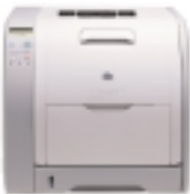
HP Color LaserJet 3550/n Printer series