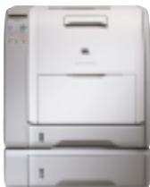
HP Color LaserJet 3700/n/dn/dtn Printer HP Color LaserJet 3700dtn shown