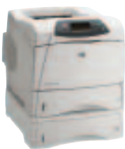
hp LaserJet 4200dtn and hp LaserJet 4300dtn