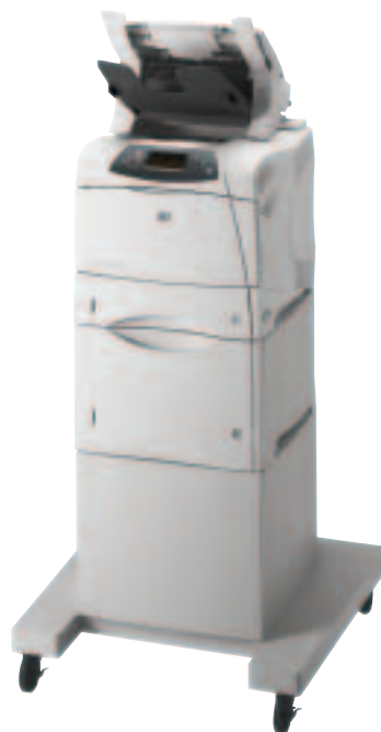
hp LaserJet 4200/4300 printer with additional accessories