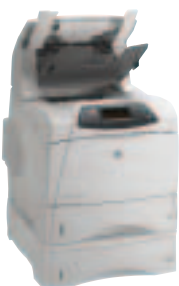
hp LaserJet 4200dtnsl and hp LaserJet 4300dtnsl

For business users in enterprise, large, medium and small organisations the HP LaserJet 4200 and HP LaserJet 4300 series offer reliable HP LaserJet performance, unrivalled versatility and an easy to use and manage solution which meets the high printing demands of workgroups of 5-15 users.