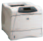
hp LaserJet 4200/n and hp LaserJet 4300/n

Exceed workgroup expectations with the HP LaserJet 4200 and HP LaserJet 4300 series' consistently high performance and print quality. Intelligent, versatile and reliable, these monochrome printers offer a wealth of features designed to make them easy to use and manage.