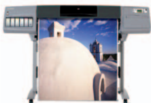
hp designjet 5500 printer (42-inch series)