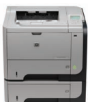
HP LaserJet Enterprise P3015x Printer