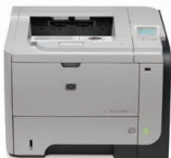
HP LaserJet Enterprise P3015 Printer

Ideal for the IT or department manager in managed office environments, particularly in security-focused businesses, such as legal firms and government agencies, supporting small work teams of 8-10 users that require fast, high quality, output.