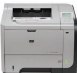
HP LaserJet Enterprise P3015dn Printer