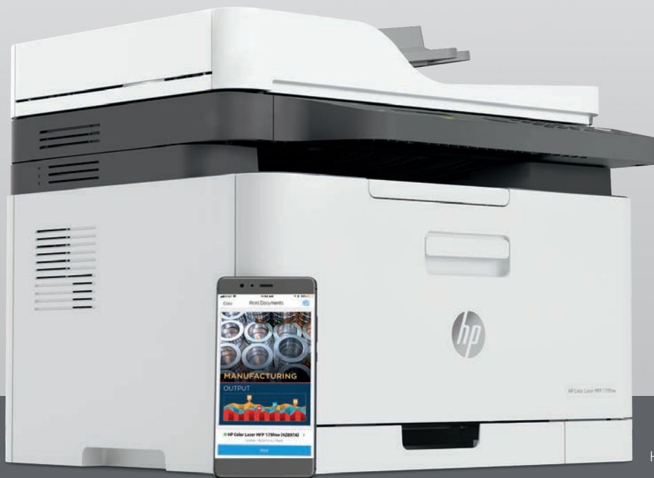
HP Color Laser 179fnw MFP

* Some features apply to specific printers in each series.