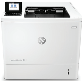
HP LaserJet Enterprise M609dn

This HP LaserJet Printer with JetIntelligence combines exceptional performance and energy efficiency with professional-quality documents right when you need them – all while protecting your network from attacks with the industry's deepest security.