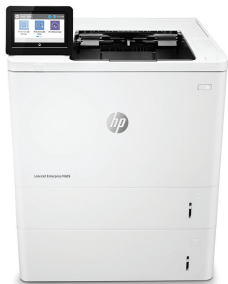
HP LaserJet Enterprise M609x